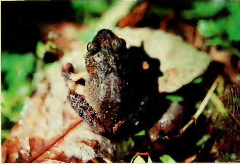
FIGURE 2. Platymantis naomii showing color pattern and dorsal skin ornamentation in life.